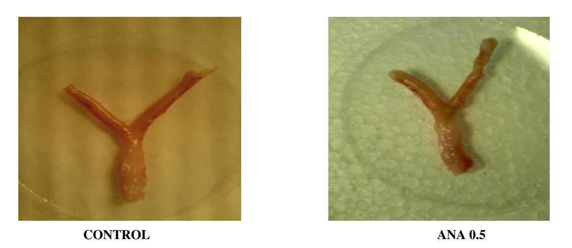
Figure 1. Uterus and vagina macroscopically after 14 weeks of anastrozole administration. Macroscopic differences between CONTROL and ANA 0.5 were not found.

CONTROL - control group without anastrozole, ANA 0.5 - group with anastrozole in concentration 0.5 mg/1 kg of food.