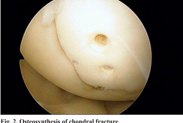
Fig. 2. Osteosynthesis of chondral fracture.

Medial meniscus was injured in 55 cases from total number of 72 meniscus rupture. Patella luxation was cause of 30 haemarthrosis (11 %). Lateral luxation was cause of all luxations. Standard anterolateral and proximal lateral port was used for visualisation of femoropatelar articulation. Only in favourable femoropatelar articulation is possible to made pure knee haematoma evacuation. It was made only in 4 cases from all our patients. Medial parapatelar ligament tear was found in 26 patients, we made acute suture with Vicryl fibre, method of transcutaneus stitch was made in 19 patients, method of open suture was made in 7 patients. Lateral patellar release was made in case of persisting lateral patellar dislocation. 20 patients underwent this procedure in our study.