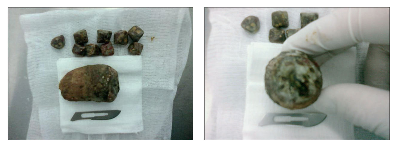
Figs 3 and 4. The gallstones extracted from the ileum.

Patients were treated either for ileus alone (group 1, 11 patients) or as one-stage procedure with urgent fistula closure (group