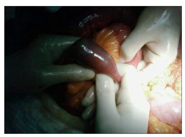
Fig. 1. Occluded ileum segment.

but other parts of GI tract can be involved including the stomach, duodenum, jejunum, and ligament of Trietz. Stone impaction at the colon is uncommon (0.5-3%) (1, 13, 14). In previous studies, the mean stone size was found to be 3.5 cm and commonly single (6, 15). Reisner and Cohen (7) reviewed 1001 cases of gallstone