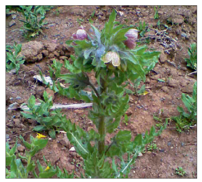
Fig. 1. Photo of Hyoscyamus reticulatus.

docholinesterase levels were found to be normal in all patients, the fact of which excluded organophosphate poisoning. Nasogastric tube, gastric lavage and supportive treatments due to symptoms (hydration, oxygen support and IV diazepam to agitated patients) were applied to all patients in the first three hours. Since the specific antidote Physostigmine could not be obtained, it could not be given to the three patients suffering from severe cholinergic symptoms. After recovery, which took 48 hours on average, the patients were discharged from emergency clinic.