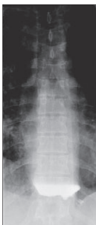
Fig. 2. Esophagogram – Achalasia gr. III.

tively. Ten patients (71.4 %) reported infrequent or no dysphagia. The values of heartburn score, nausea/vomiting after meal, and asthma/coughing prior and after surgery follow: 4.3 \pm 2.2 , 2.4 \pm 1.6 (heartburn), 5.4 \pm 3.1 , 1.3 \pm 1.2 (nausea/vomiting), 5.7 \pm 3.1 , 1.2 \pm 1.0 (asthma/coughing). These results are summarized in Table 1. All the observed symptoms were statistically improved after surgery (Student t-test, p=0.05 ).