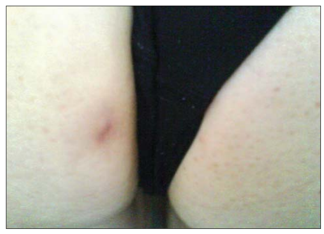
Fig. 4. The condition after treatment and after removing one botfly larva Dermatobia hominis in the lower left gluteal area – infected site healed first.