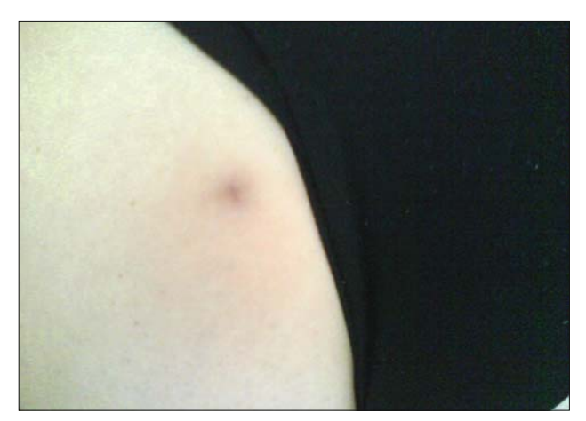
Fig. 5. The condition after treatment and removing two botfly larvae Dermatobia hominis in the upper left gluteal area – infected site fully healed not until two months.