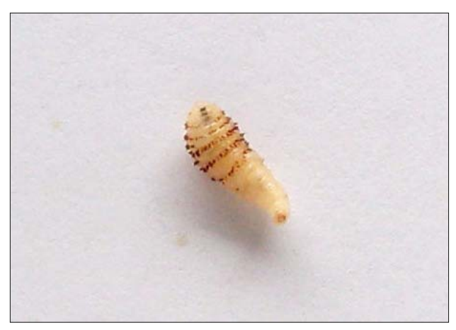
Fig. 2. Dermatobia hominis – second-instar larva, 1cm long, yellowish colour – ventral side of the body with dark brown spines in the circumference. The larva was removed from the furuncle in the proximal left gluteal area.