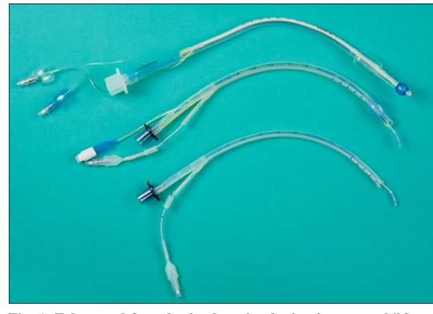
Fig. 1. Tubes used for selective lung intubation in young children. Double-lumen tube No. 26, below Univent No. 4.5 with extended and inflated obturator. At the bottom – the smallest available tube for selective intubation Univent No. 3.5 (see Tab. 1).

bility of intermittent aeration of the lung being operated on (1, 2). Endobronchial intubation in a small child can be supplemented by endotracheal intubation using an additional tube which enables to control the ventilation of each lung separately. This technique is not commonly used with respect to high respiratory resistance of these two thin tubes, difficult cleaning of airways and the danger of vocal ligament injury and lower airways injury. Various improvised bronchial obturators are often used, which are either blindly or under fibre optic control inserted in to the lung to be treated and then supplemented with endotracheal intubation. Fogarty thrombectomy catheter or angioplasty catheter are the most commonly reported devices in this context (3). A whole range of bronchial obturators manufactured for this purpose is used for standard completion of this method. Arndt obturator is the most commonly used type (4, 5).