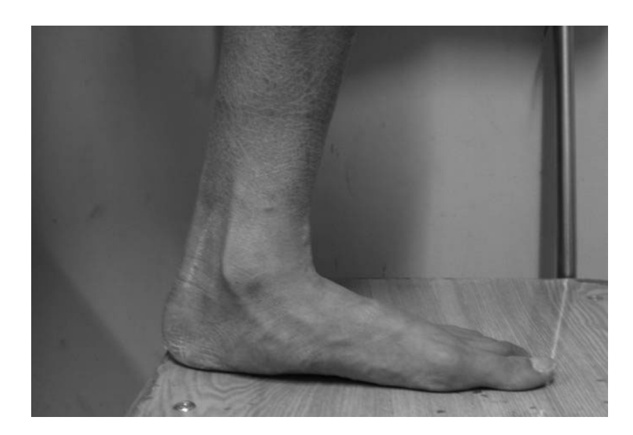
Fig. 2 Pes planus (notice the dry and rough skin)

terion of ocular and cardiovascular system and had skeletal system involved. So she was diagnosed as MFS even without a definite family history.