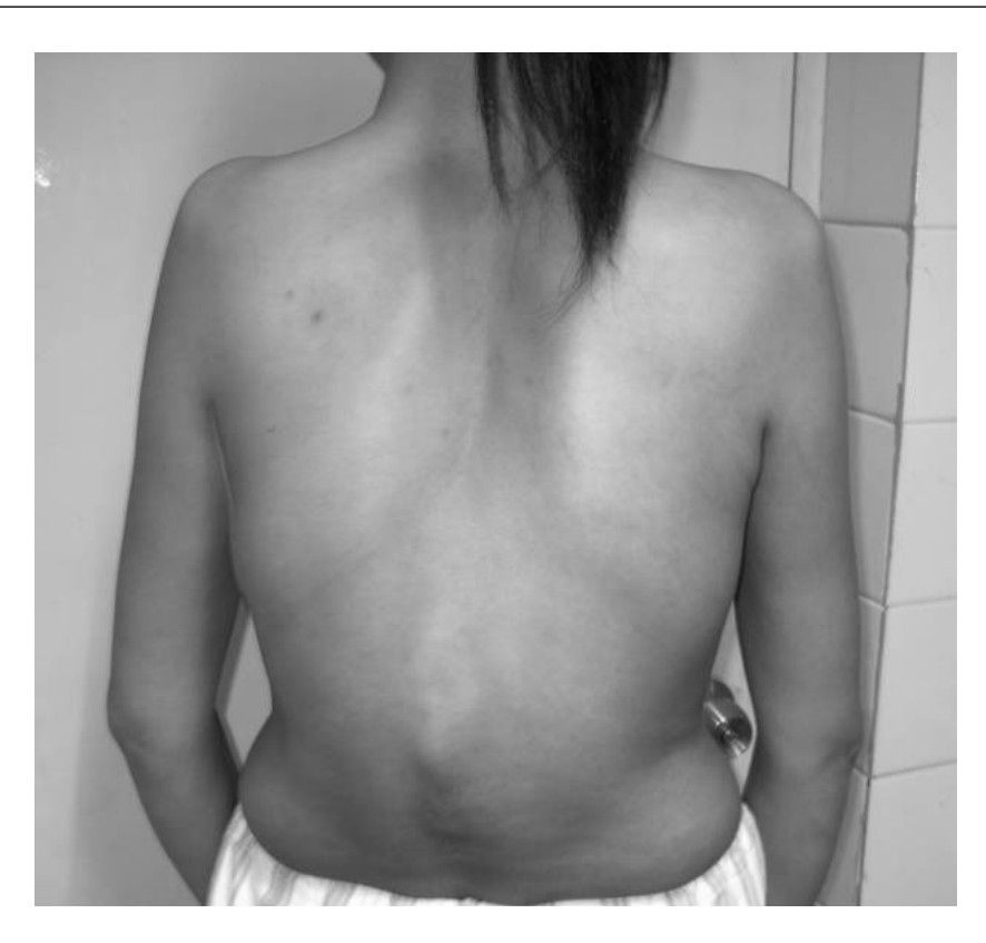
Fig. 4 Spinal colum malformation (scoliosis and kyphosis of thoracic vertebra)