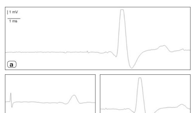
Fig. 1. EMG Record. a) Normal group, b) Surgery+Water group, c) Surgery+TMZ group.

*p<0.0001, surgery+water group compared with Normal control, ##p<0.0001, surgery+TMZ group compared with Surgery+Water group, #p<0.05, surgery+TMZ group compared with Surgery+Water group, EMG: Electromyography, CMAP: Compound Muscle Action Potential, TMZ: Trimetazidine