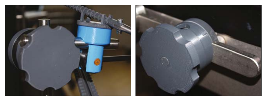
Fig. 2. Fixation elements made of ABS material.