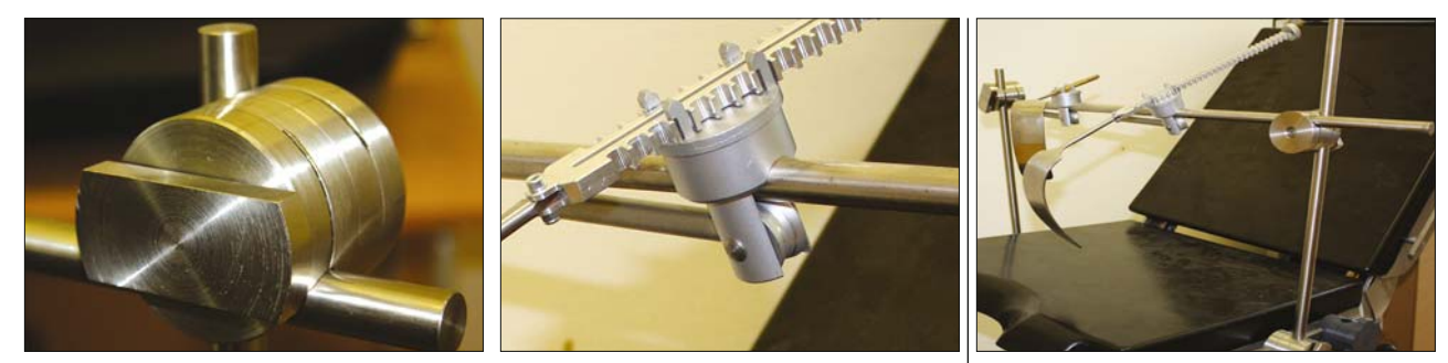
Fig. 6. Different fixation parts: frame and instruments.