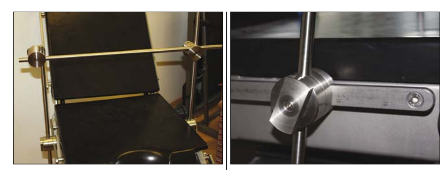
Fig. 3. Proposed frame of retractor.