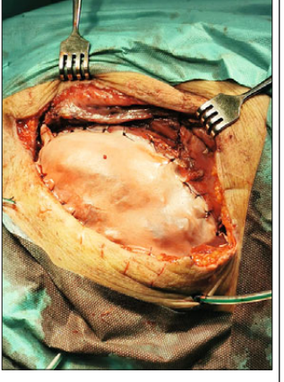
Fig. 8. The debrided wound, with a prepared wound bed, the exposed kidney was covered by ADM, the edges sutured to healthy fascia.