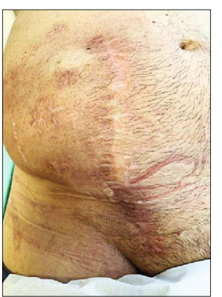
Fig. 9. Healed reconstructed abdominal wound, 6 months postoperation.

with a solid scar in soft tissue reconstructions (53–55). Even though the new ADM scaffold material was described as "permanent", generally, it is considered that the transplanted scaffold will be repopulated by the host dermal cells capable to resynthesize a new autologous dermal matrix (1, 8).