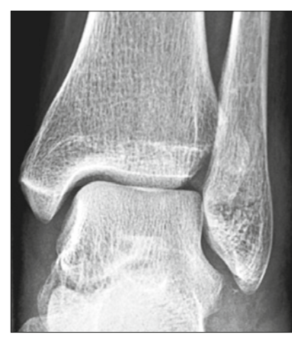
Fig. 1. "Invisible" Tillaux fracture.