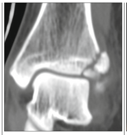
Fig. 2. The same fracture as in Fig. 1 on CT scan.