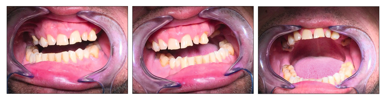
Figs 10, 11 and 12. Mandibular function 1 month after ORIF.

After gentle cranial (proximal fragment) and caudal traction (distal fragment) with retractors, the surgeon will have a good view of the fragments. After anatomic reduction, the fractured stumps were rigidly fixed using different plates (2 straight plates, lambda and trapezoid plates-TCP, chosen according to the individual fracture type) and appropriate screws (Fig. 5). In complex low-neck fractures cases, the authors will typically first fix the plate to the proximal fragment with 2 screws, then reduce the fracture. The posterior border of the ramus and the sigmoid notch are the most important landmarks for proper reduction. After checking the position of fragments in both of these areas, screws were fixed to the distal fragment. In pediatric patients and some low-neck fractures, there is very little space for 2 plates when approached via the periangular approach. In these cases, the authors prefer lambda or TCP plates (Figs 6 and 7).