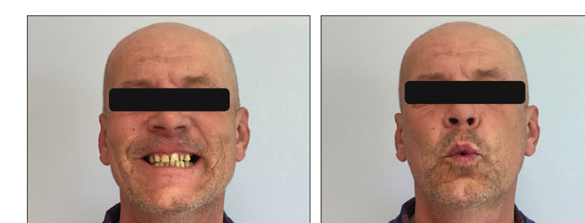
Figs 8 and 9. Facial nerve function 7 days after ORIF.

dylar fragment. Exclusion criteria were: 1) patients younger than 12 years, 2) edentulous alveolar ridges, 3) high risk of general anesthesia, 4) noncompliant patients.