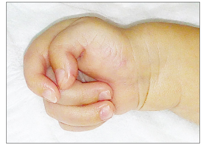
Fig. 2. Atypical finger crossing of the left hand.