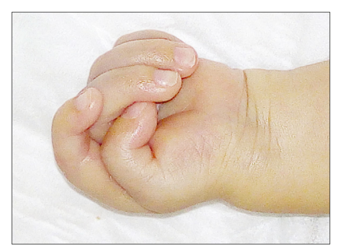
Fig. 3. Atypical finger crossing of the right hand.

Based on many dysmorphic features, nephropathy (dilatation of grade I on the right kidney and of grade II on the left kidney), hepatopathy, hypopotassaemia, hyponatraemia, repeated infections, and skeletal abnormalities, the investigation of a congenital disorder of glycosylation was indicated. Type I N-glycosylation was suspected due to the repeated positive result of the CDG screening. The TLC detection of mono- and disaccharides revealed a distinctive spot of glucose and galactose in accordance with the quantitative determination of both analytes. A slightly increased excretion of galactitol in the urine was captured (embryotoxon was negative). The result of glycan analysis supports the assumption of a supposed glycosylation disorder and also specifies a specific subtype, namely CDG-1, subtype ALG12-CDG (Ig).