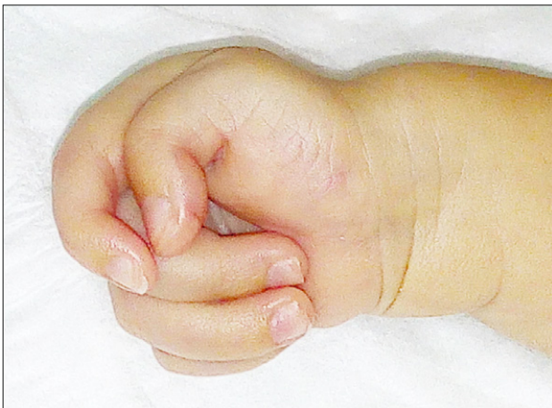
Fig. 2. Atypical finger crossing of the left hand.

Based on many dysmorphic features, nephropathy (dilatation of grade I on the right kidney and of grade II on the left kidney), hepatopathy, hypotassaemia, hyponatraemia, repeated infections, and skeletal abnormalities, the investigation of a congenital disorder of glycosylation was indicated. Type I N-glycosylation was suspected due to the repeated positive result of the CDG screening. The TLC detection of mono- and disaccharides revealed a distinctive spot of glucose and galactose in accordance with the quantitative determination of both analytes. A slightly increased excretion of galactitol in the urine was captured (embryotoxon was negative). The result of glycan analysis supports the assumption of a supposed glycosylation disorder and also specifies a specific subtype, namely CDG-1, subtype ALG12-CDG (Ig).