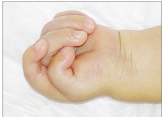
Fig. 3. Atypical finger crossing of the right hand.

The congenital disorder of glycosylation, type Ig or ALG12-CDG, is an inherited disorder that can affect several body systems and present with a different clinical picture in each patient. Up to this date, only 9 ALG12-CDG patients were reported worldwide. The first signs and symptoms of the condition usually appear during infancy and can present as feeding problems, failure to thrive, delayed development, intellectual disability and hypotonia. Furthermore, patients can have dysmorphic facial features such as epicanthic folds, prominent nasal bridge and abnormally shaped ears,