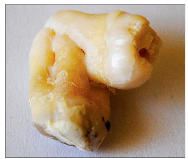
Figs 2 and 3. Extracted fused teeth after cleaning (2nd maxillary molar with impacted 3rd molar).