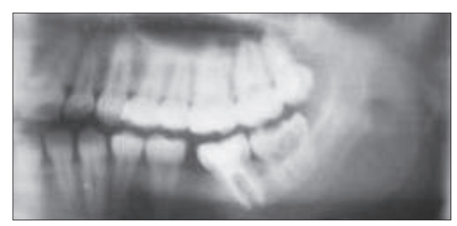
Fig. 6. OPG image with the 3rd mandibular molar fused with a supernumerary tooth.

gingiva – the mucoperiost was uncovered. The vestibular cortex of the bone over the roots was inflamed. The impacted third molar was overlapped at the top by a thin cortical layer of the bone. Carefully we started with subluxation of the second molar. This phase of extraction was successful and the tooth was luxated (disjointed) in the alveolus, but the attempt to extract it failed. Using a bone cutter we removed the cortical layer of the bone over the crown of the impacted tooth. Further attempts to remove the impacted third molar indicated simultaneous movement of both teeth in the bone. We had to extend the osteotomy around the crown of the impacted third molar and to extract both teeth simultaneously in one block. The second and third molars were fused together with interlocked roots, and formed one complex (Figs 2 and 3). After extraction, the wound was carefully treated. A negative Valsalva maneuver and a probe did not indicate the presence of oro-antral communication. Having completed a thorough excochleation of the bone, we rinsed the wound with physiological solution and filled it with absorptive fibrinous foam with PRP. The wound was subsequently sutured with individual Vicryl (pyloglactin 910) sutures of the size 4/0. After the