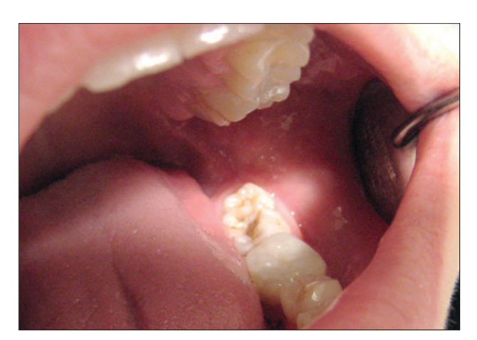
Fig. 7. Finding from the OPG image (Fig. 6) and its state in the oral cavity.