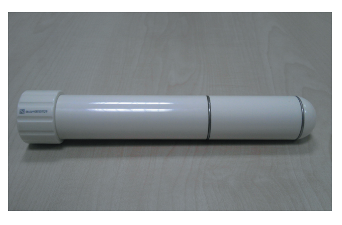
Figure 1. CT-compatible vaginal cylindrical aplicator (High-dose-rate Brachytherapy cylinder)

After fixation of Bodyfix localizer (Medizintechnik GmbH, Germany) to CT Simulator, cross-sectional images with 1.25 mm slice thickness were acquired. In simulation for SBRT boost planning, 274 miliampers (mA), 400 width, and 50 length were used as CT acquisition parameters. The acquired images from CT Simulator were sent to the contouring workstation via network for SBRT planning. Advantage SimMD simulation and localization software (Advantage SimMD, GE, UK) was used to contour the CTV and organs-at-risk (OARs). Pretreatment MRI of patients were used to evaluate disease extent but not for treatment planning purposes since the main tool for SBRT planning was CT images acquired with vaginal cylinder. CTV2 was contoured as the upper two thirds of vagina (approximately 4 cm). Surrounding critical structures including the bladder, rectum, small bowel and femoral heads were contoured as OARs in planning CT images according to ICRU 38 recommendations [5]. 3D expansion of the CTV2 by 5 mm isotropically generated the PTV, which is consistent with the literature [6, 7].