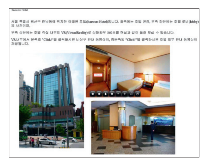
Fig. 1. Hotel webpage with embedded VR of a room with click" symbol on the entrance door.