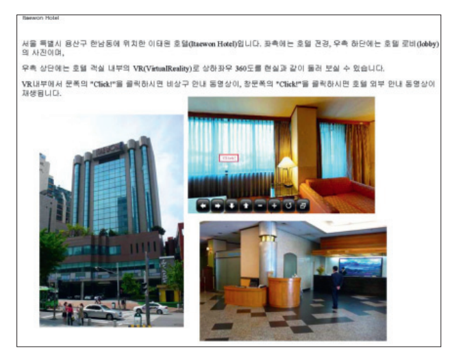
Fig. 2. Hotel webpage with embedded VR of a room with click" symbol on the front window.

Figure 2 is the page of the hotel website that contains the embedded virtual reality capable room picture with the front window shot where "click" symbol is attached.