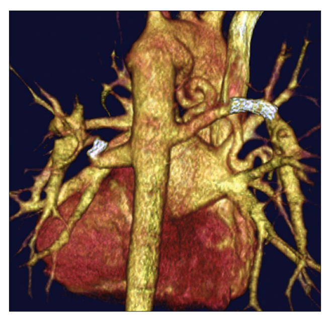
Fig. 3. Computed tomography angiography (VRT – reconstruction; posterior view) after stent implantations into stenosed segments of MAPCAs.

increased from 2.5 mm to 5.5 mm. Pressures in MAPCA distally to implanted stent increased from 14/15/18 mm Hg to 28/27/26 mm Hg. 6 MWT walking distance increased from 180 m to 270 m. There were no intervention related complications. Implantation of next PG 2460PPS stent into left-sided MAPCA was performed following year. Arterial satO2 increased from 76 % to 82 %. Post-stenting angiography confirmed markedly improved pulmonary blood flow to left lung. Effective lumen of MAPCA increased from 2.2 mm to 5.0 mm. Pressures in MAPCA distally to implanted stent increased from 14/13/13 mm Hg to 19/15/17 mm Hg. 6 MWT walking distance increased from 270 m to 400 m. There was no intervention related complication. Effective result of both stent implantations is shown in Figure 3. Progressive arterial satO, decrease to minimum 66 % was followed in mid-term follow-up. CTA revealed in-stent stenoses in both stents caused by neointimal fibroproliferation 5 years after first stent implantation. Angiography confirmed 4.5 mm effective lumen diameter in