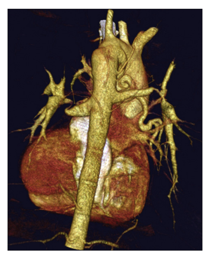
Fig. 1. Computed tomography angiography (VRT – reconstruction; posterior view) of bilateral MAPCAs with significant segmental stenoses.

19-years old male patient with non-surgically treated PA, VSD, MAPCAs clinically presenting with central cyanosis, arterial satO<sub>2</sub> 72 %, NYHA III, and recurrent syncopes. CT-angiography delineated two segmentally stenosed MAPCAs (Fig. 1). PG2460PPS stent was implanted into right-sided MAPCA consequently (Fig. 2A). Arterial satO<sub>2</sub> increased from 64 % to 79 %. Post-stenting angiography confirmed markedly improved pulmonary blood flow to right lung (Fig. 2B). The minimal stenotic diameter of MAPCA