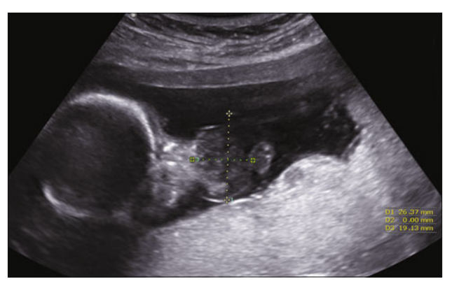
Fig. 2. Transabdominal ultrasound: A "sack" like oval formation of cca 26 x 19 mm and mixed echogenity in front of the oral cavity (orally herniated meningoencephalocele)

In up-to date scientific literature fetal oral trans-sphenoidal meningoencephalocele was never reported, three analyzed intracranial pathologies were never described together, nor such a sequence defect. The diagnosis of the three mentioned pathologies in the 18-week fetus (sellar teratoma, arachnoidal cyst, oral transsphenoidal meningoencephalocele) represents the type of novel sequence. As a pathogenesis, we described that the intracranial sellar teratoma created an aperture for meningoencephalocele in the cranial base and the arachnoidal cyst facilitated the protrusion by its growth and pressure. The amniotic fluid index was normal in this case. This is also a rare condition by the oral fetal masses. We assume, that the protrusion of the tumor in front of the mouth enabled normal fetal swallowing and circulation of the amniotic