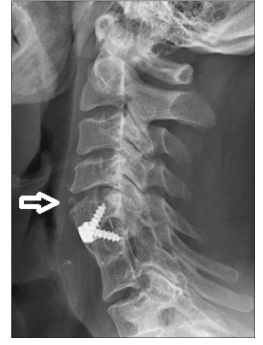
Fig. 3. Adjacent segment degeneration C4/5 in form of incrustation of anterior longitudinal ligament.