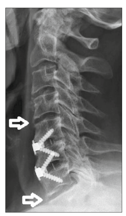
Fig. 4. Proximal and distal adjacent segment degeneration in form of the formation of ventral osteophytes.

CS was defined as a decrease in the relative motion segment's height, namely by 10 % and more when compared to the early post-operative finding. The impact of factors such as patients' sex, age, number of operated segments and osteoporosis on the incidence of CS was statistically evaluated using the Fischer's exact test. Twelve months after ACD, the effect of CS was evaluated with regards to the efficiency of the surgical treatment (VAS C, VAS UL, NDI, Odom's criteria). This was done both separately for VPMS, and DPMS, and concurrently for both sides. The significance of this effect was evaluated by means of the Student's unpaired t-test. The relationship of the extent of distraction of VPMS and DPMS in the early postoperative period to the incidence of CS was evaluated using the Student's unpaired t-test. A value of p < 0.05 was defined as statistically significant.