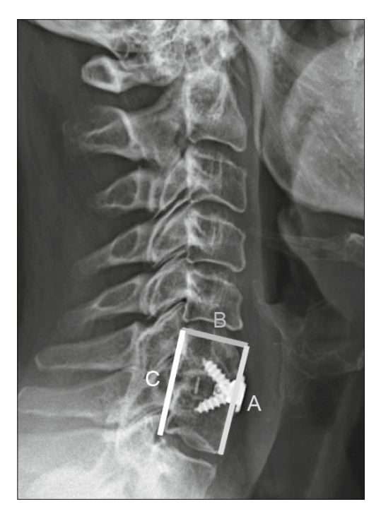
Fig. 2. Method of measuring the relative height of the ventral (A/B) and dorsal (C/D) motion segment parts

level of anterior margins of vertebral bodies to the length of upper endplate of the proximal vertebral body. Similarly, the dorsal part of the motion segment (DPMS) was assessed as a ratio of the motion segment's height measured at the level of posterior margins of the vertebral bodies to the length of upper endplate of the proximal vertebral body (Fig. 2). The relative heights of motion segments were also measured preoperatively, early postoperatively (within first 48 hours) and as part of follow-ups performed 6 weeks, 3 months, 6 months and 12 months after the surgery.