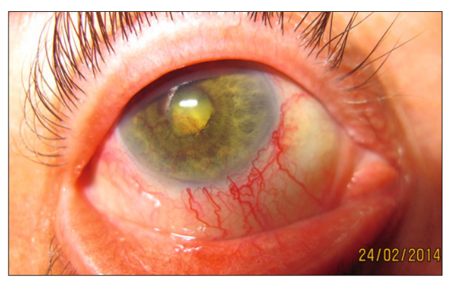
Fig. 2. Macrophotograph of the same patient's anterior segment 1.5 years after SRS with developed secondary neovascular glaucoma and complicated cataract.